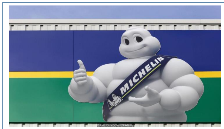
The Michelin Man - Bibendum

Born in 1898, the Michelin company’s unmistakable mascot, Bibendum as he’s known in France, turned 120 last year. An exhibition at L’Aventure Michelin, showed the best side of the one of the world’s oldest company mascots by assembling 120 drawings from across the decades, showing his evolution from an obese character puffing on a cigar to a slimmer figure, although still with a pillowy silhouette.