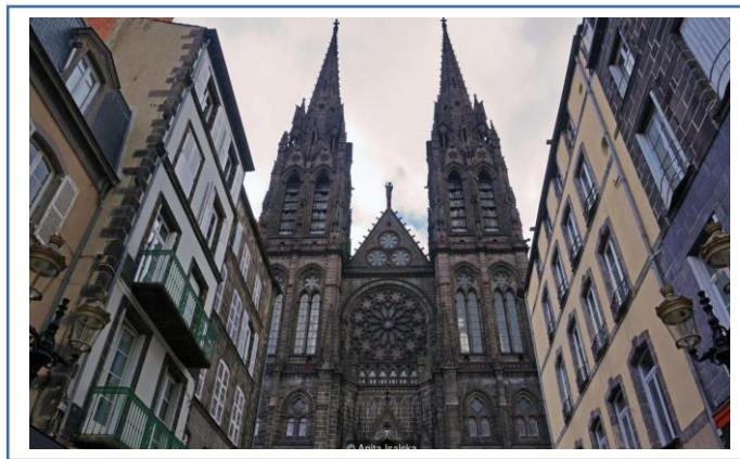
The French city of Clermont- Ferrand

Clermont-Ferrand's cobblestoned lanes and lava-stone buildings look more quaint than revolutionary. But this French city changed the world of travel forever when, in 1889, brothers André and Édouard Michelin founded their tyre company there.